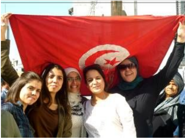
Young women voters in « Bab Souika - Tunis » on election day

On October 23, 2011, Tunisian citizens went to the polls in the country's first free and fair election, casting their vote for a Constituent Assembly that will head the drafting of a new Constitution and schedule imminent parliamentary and Presidential elections. Election day in Tunisia was distinctly serene, and emotional for many, as millions of Tunisians exercised their right to vote for the very first time in their lives. October 23, 2011 marked the end of a ten-month long transitional period in which new parties were forming by the day (111 political parties competed in the elections) and civil society organizations mushroomed from approximately 8000 under Ben Ali to over 20,000 by the summer of 2011. (continued on page 2)