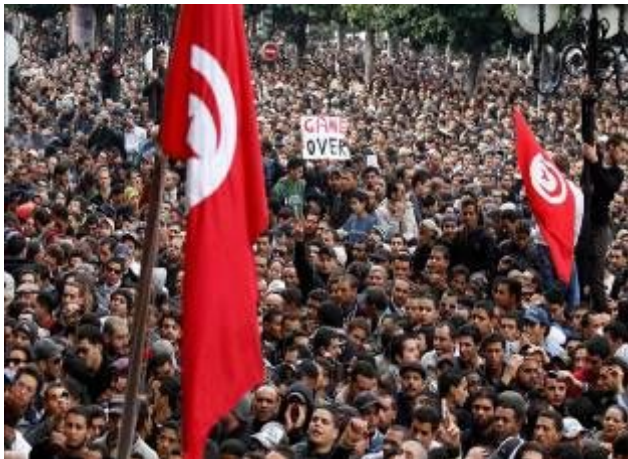
Protesters on Avenue Habib Bourguiba on January 14, 2011

2011 marked one of the most extraordinary years in the history of Tunisia, as well as the Middle East and North Africa more generally. In December of 2010, a young street vendor by the name of Mohamed Bouazizi set himself on fire in the Southern town of Sidi Bouzid, sparking nation-wide protests in Tunisia that eventually forced Zine Abedine Ben Ali out of power, ending his 23-year rule. Inspired by the Tunisian Revolution of January 14, 2011, citizens across the Middle East and North Africa took to the streets demanding a variety of changes from incremental policy reform to the ouster of unpopular leaders. The Tunisian Revolution unleashed widespread feelings of discontent, from economic grievances to demands for more socio-political liberties. For many young Tunisians, the Revolution marked the first instance