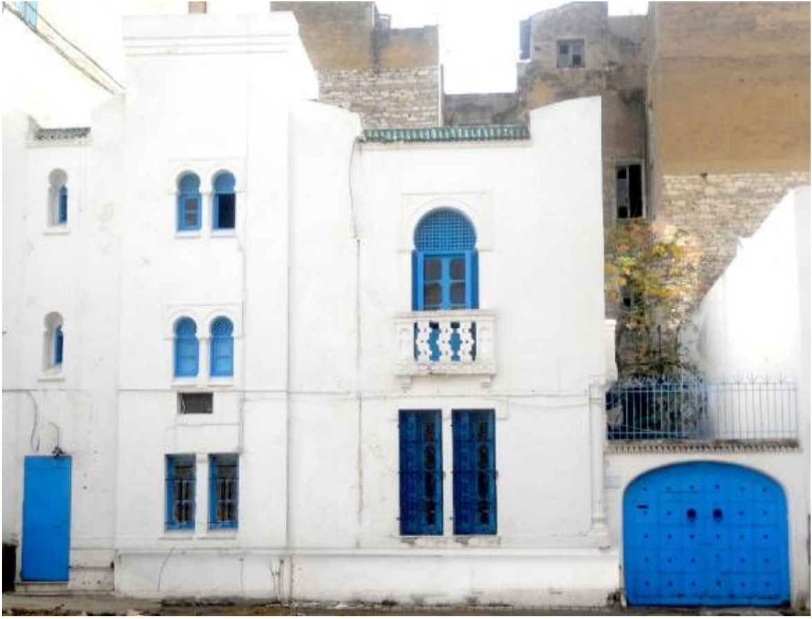
CEMAT villa "Maria Carlotta" seen in full for the first time due to construction next door.