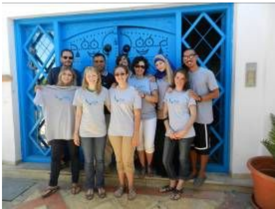
CLS students in front of the language school in Sidi Bou Said